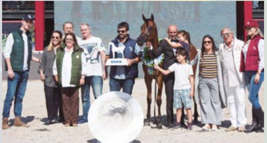
Silver Champion Jr. Filly, Clio Cerise from Haras El Olimpo