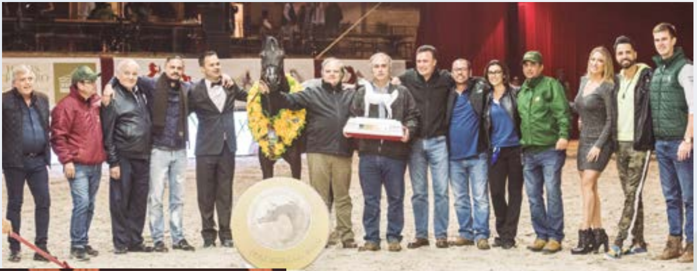
Gold Champion Mare, Lumiar Ethna from Haras Panquehue and Aguas Claras