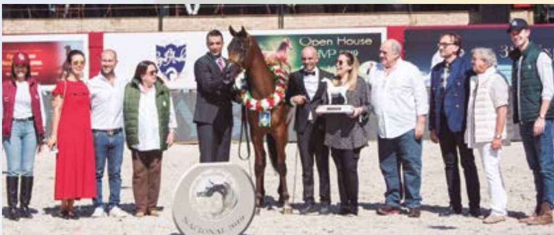
Bronze Champion Young Colt, FT Ektor from Rancho Quatro Estações