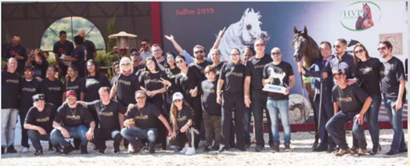
Silver Champion Colt, Vivaldi Al Shawan from Haras De Al Hosçan