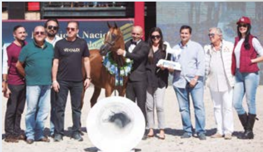
Silver Champion Jr. Colt, Gran Horik from Haras ESJ