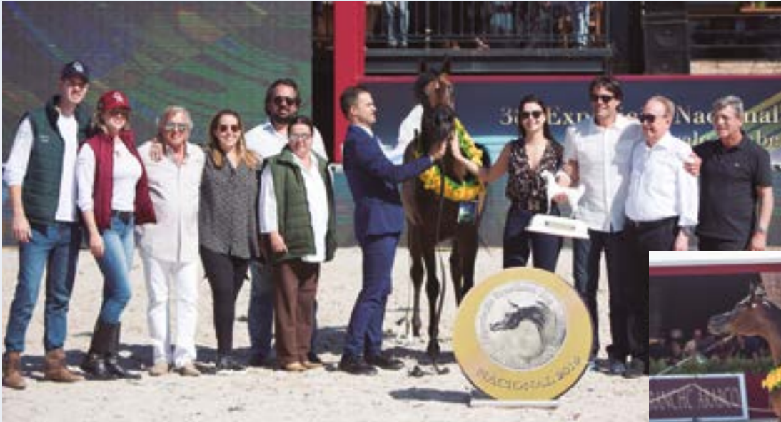
Gold Champion Colt, Intense Arabco from Rancho Arabco