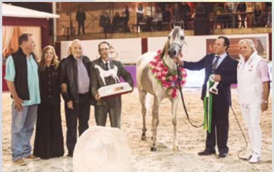
Bronze Champion Young Mare, Charis RBV from Haras Vila dos Pinheiros