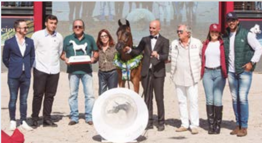
Silver Champion Yearling Colt, Hesperado LA from Haras Cruzeiro