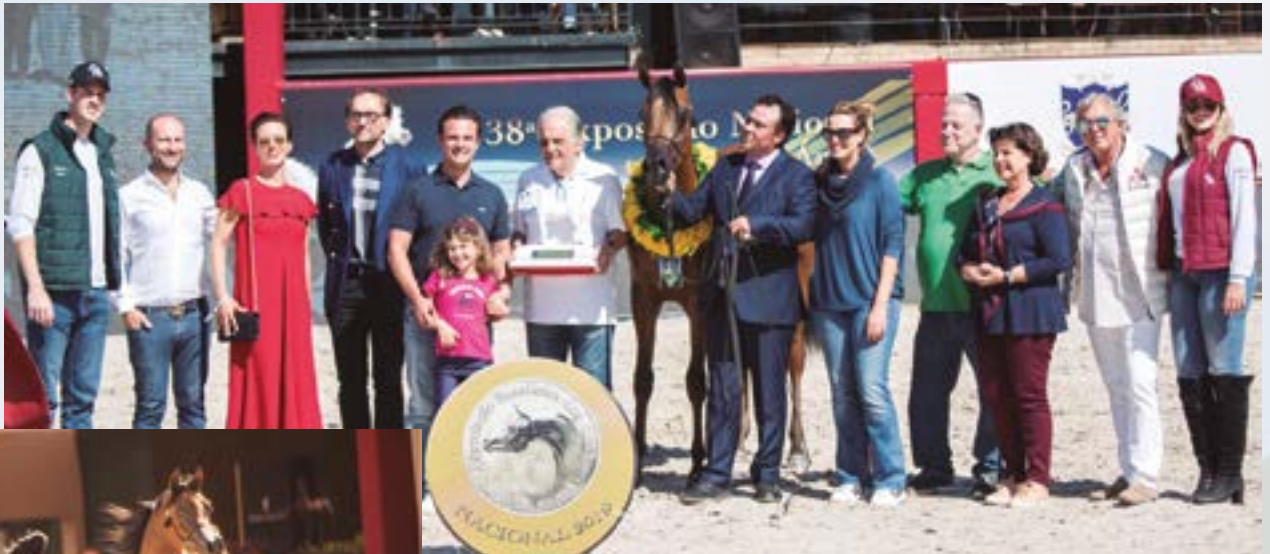
Gold Champion Young Colt, RFI Unique from RFI Arabians