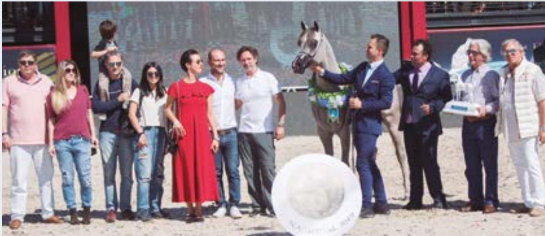
Silver Champion Young Colt, Positano ELS from Estância Lago do Sol