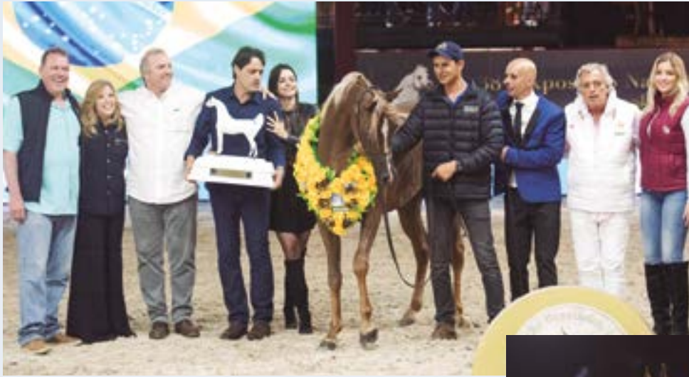
Gold Champion Young Mare, Shakhya Arabco from Rancho Arabco