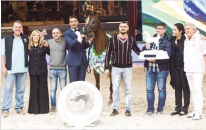
Silver Champion Young Mare, HDF Munique from Haras das Faias