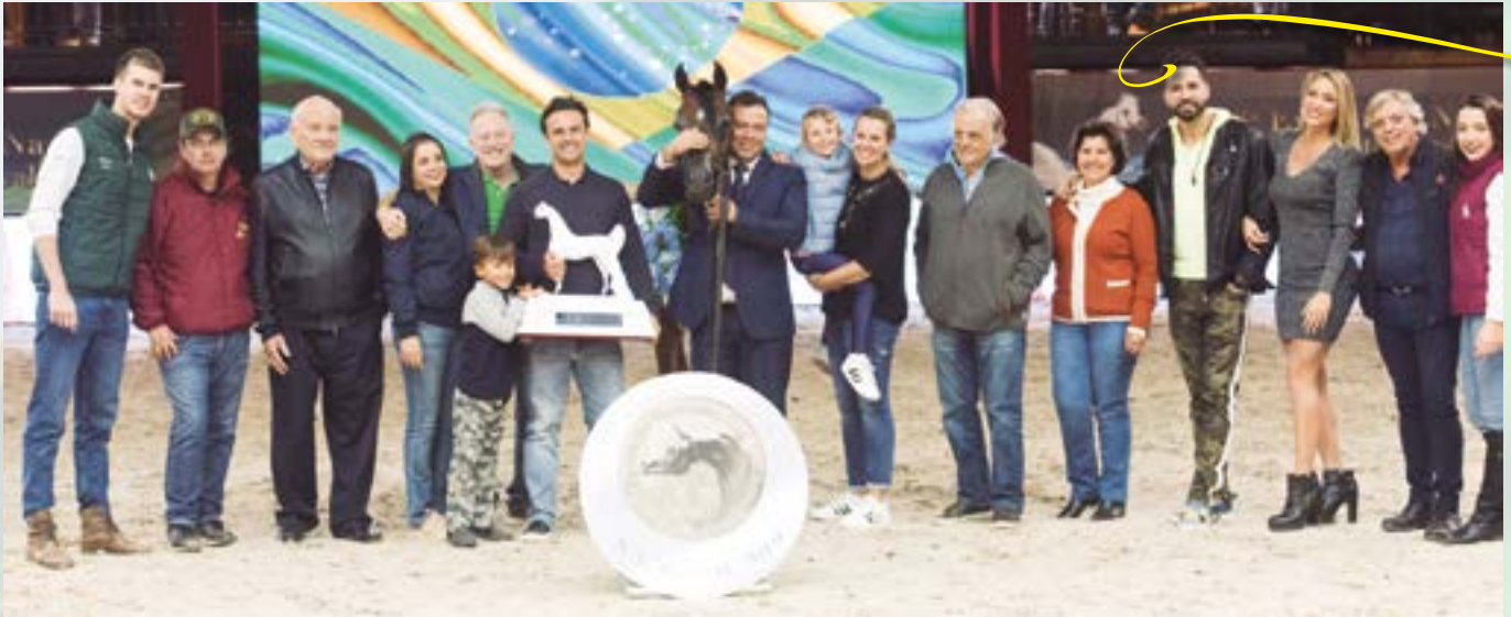
Silver Champion Mare, RFI Sensation from RFI Arabians