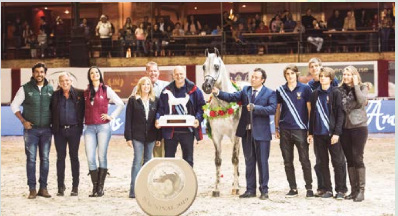
Bronze Champion Stallion, Elferus from Rach Stud