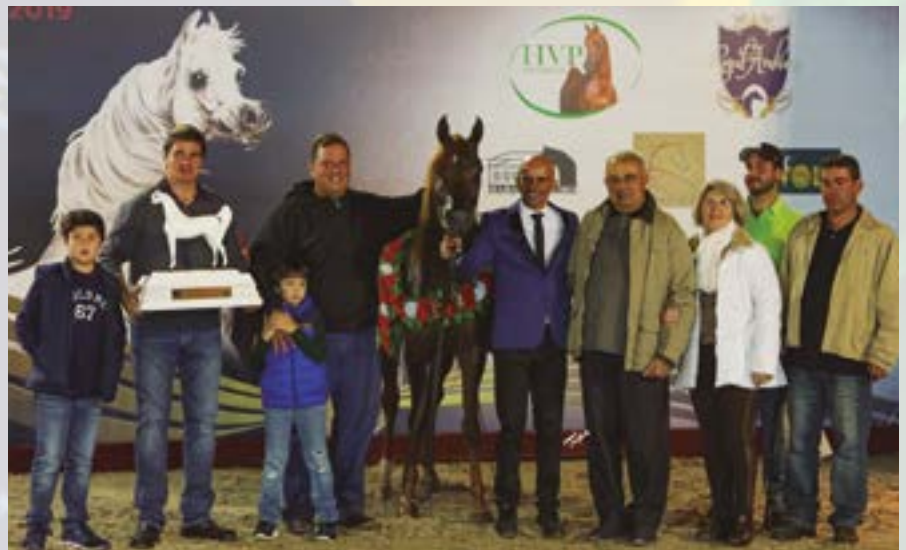
Bronze Champion Young Stallion, TS Prince El Khidam from Haras Arco Azul