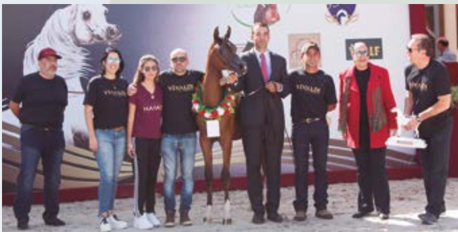
Bronze Champion Yearling Colt Gran Luigi from Haras De Al Hosçan