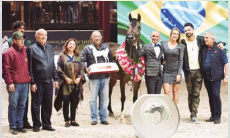
Bronze Champion Mare, Yasmin HWM from Haras Cruzeiro