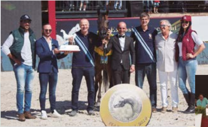
Gold Champion Filly, Preferida Rach from Rach Stud