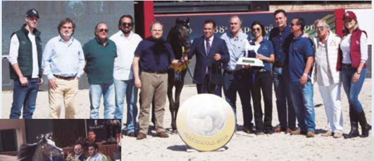
Gold Champion Jr. Colt, Hariry MAM from Haras Panquehue, Aguas Claras and Dona Francisca