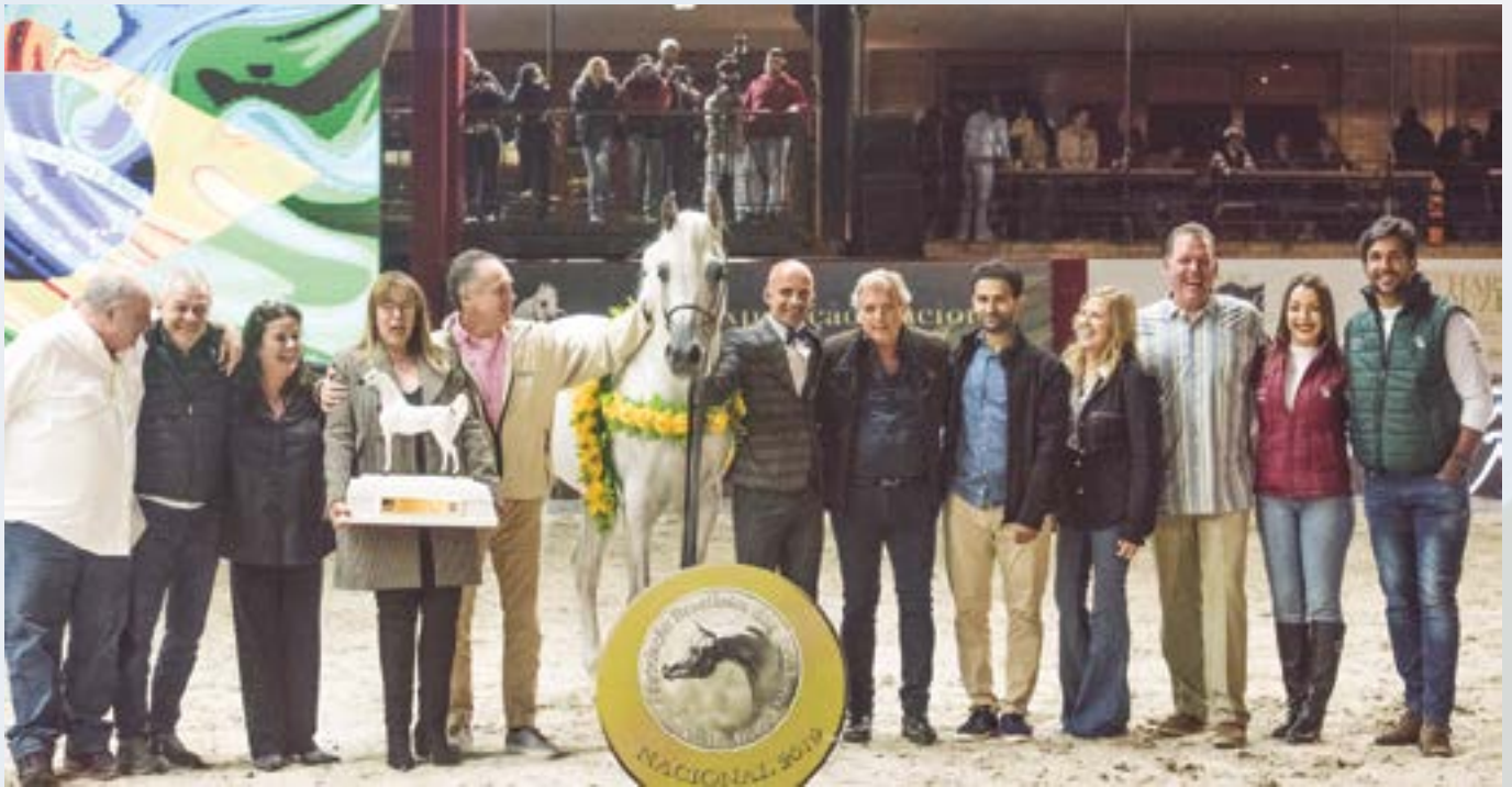
Gold Champion Stallion, El Jahez WH from Haras Quatro Estações, Serondella, Ludfour and Panorama