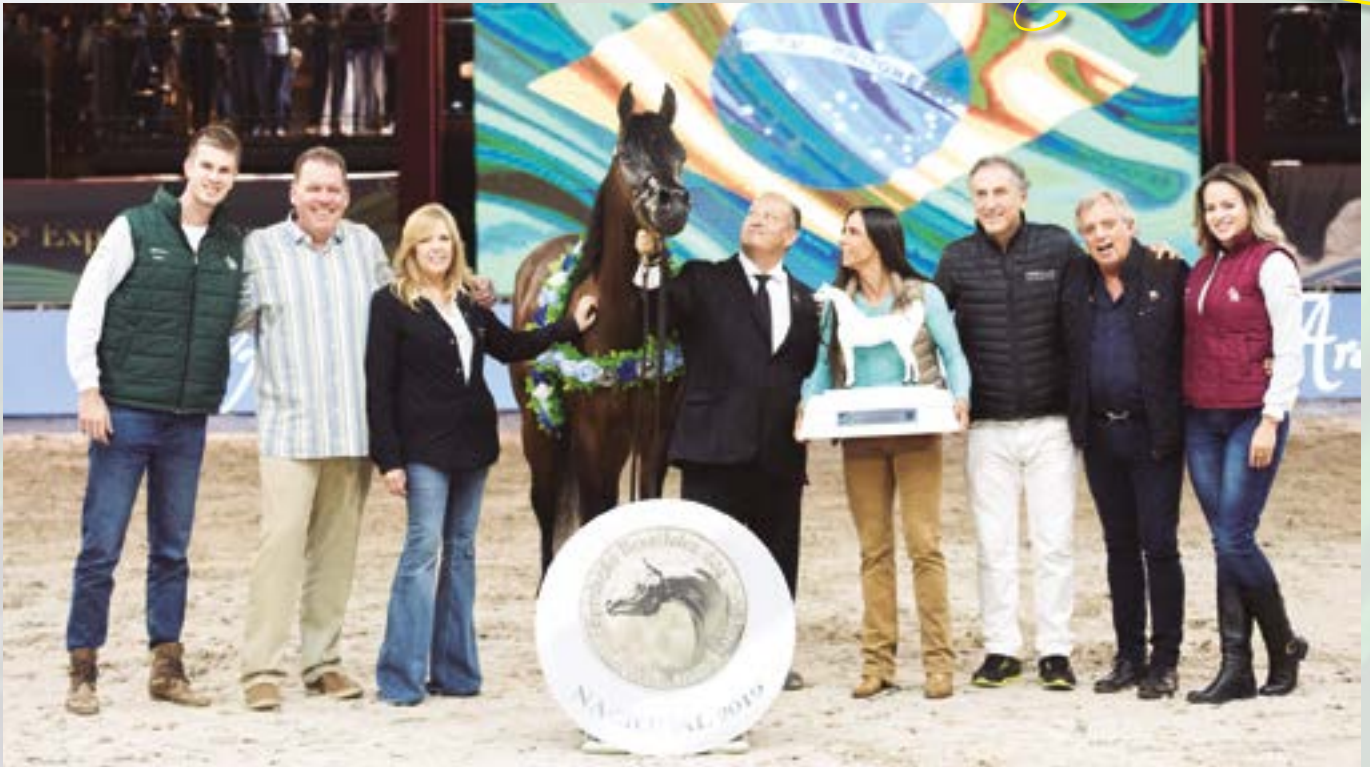
Silver Champion Stallion, AAS-Elishahh from Fazenda Floresta