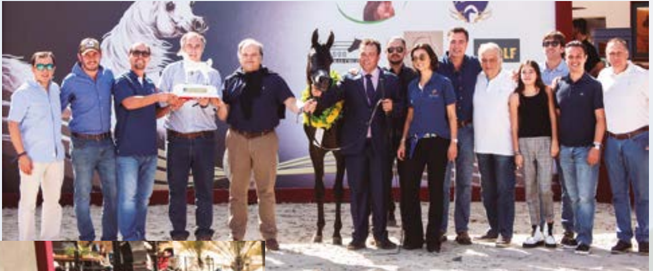
Gold Champion Yearling Colt, Aswad, from Haras Panquehue, Aguas Claras and Dona Francisca