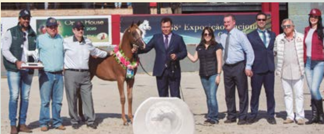
Bronze Champion Yearling Filly, Mystic Dominic HVP from Haras Vila dos Pinheiros