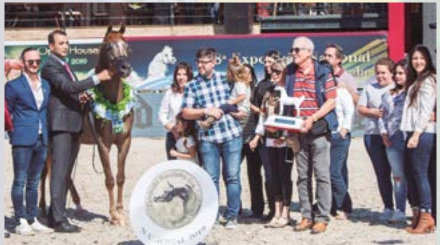
Silver Champion Filly, HDF Barcellona from Haras das Faias