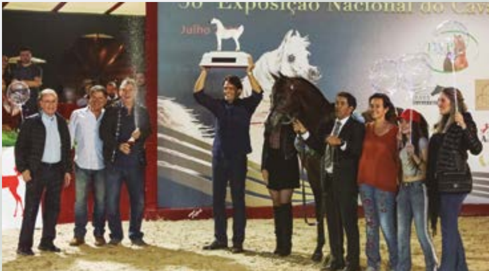
Silver Champion Young Stallion, Meteor Arabco from Rancho Arabco

Young Horse and Stallion Champion, ending his career at ring as the World Champion in Las Vegas (USA), passing away shortly after that. *FA El Shawan sowed his quality with more than three hundred males and females born in the country. Besides himself, six of these male sons also bred National Champions this year.