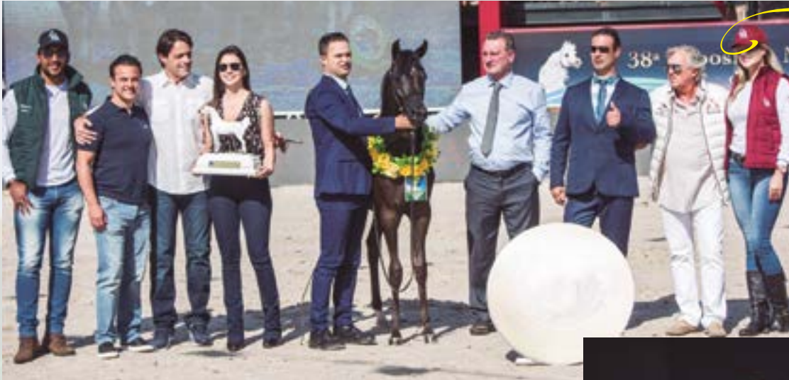
Gold Champion Yearling Filly, Marcelha Arabco from Rancho Arabco