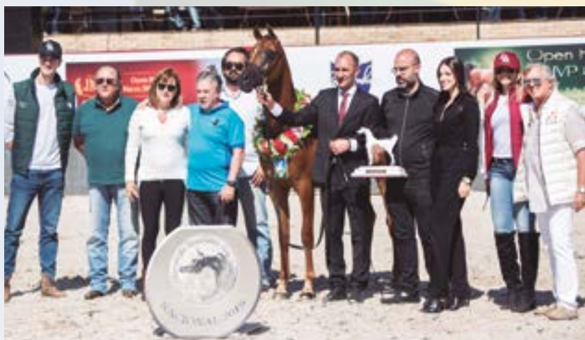
Bronze Champion Jr. Colt, Darin HVF from Haras Vale Formoso