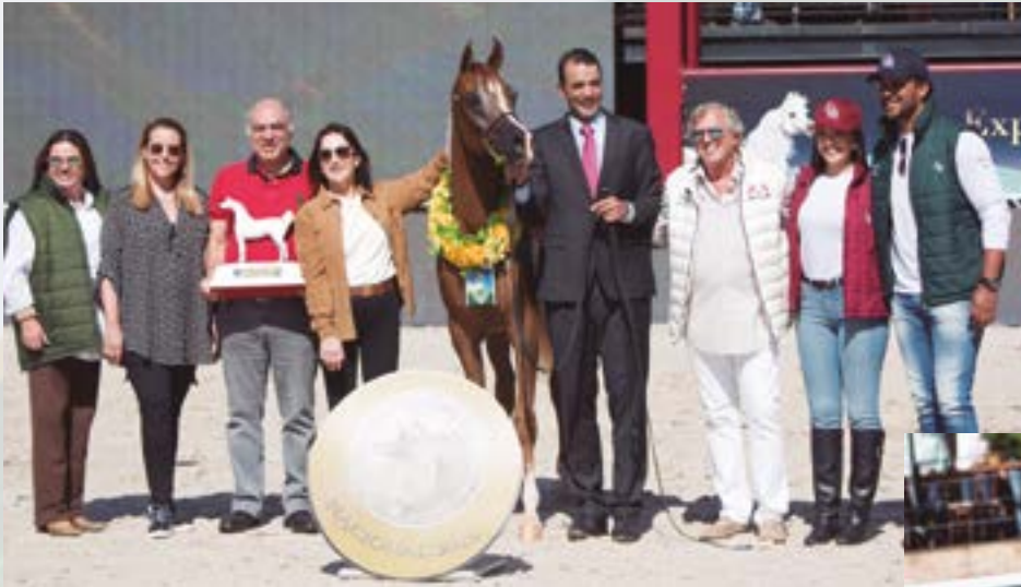
Gold Champion Jr. Filly, Lady Dominica JSZ from Haras Santa Marta