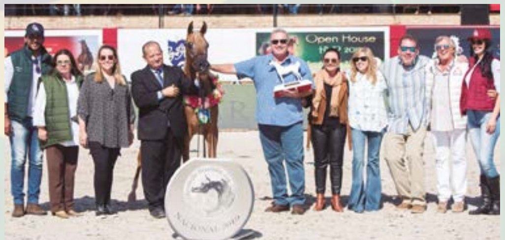
Bronze Champion Jr. Filly, Elegance AI from Haras Canaã